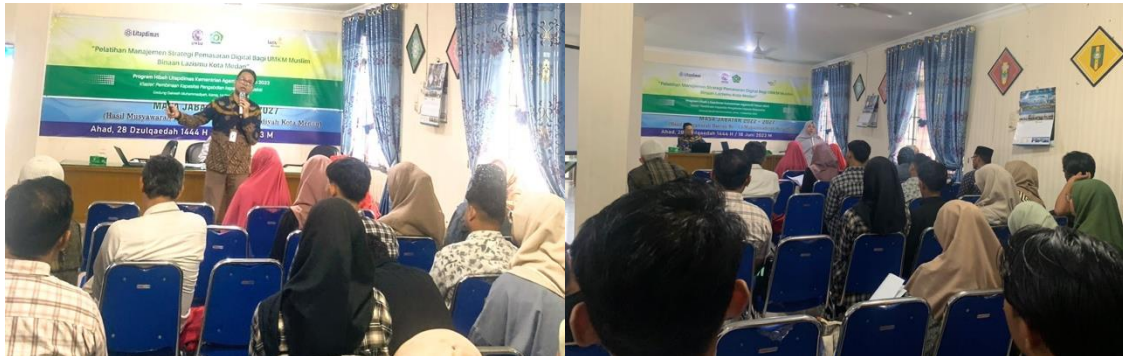
Figure 1. presentation of digital marketing materials

business, SEO (Search Engine Optimization) techniques, and online advertising strategies. The presenters, who are experts in the field of digital marketing, present these topics in an easy-to-understand manner, ensuring that participants from various educational backgrounds can follow well (Figure 1).