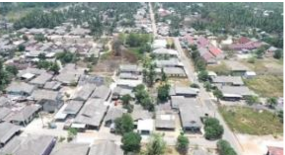
Figure 4. Bird eye shot (left) and tilt reveal shot (right)