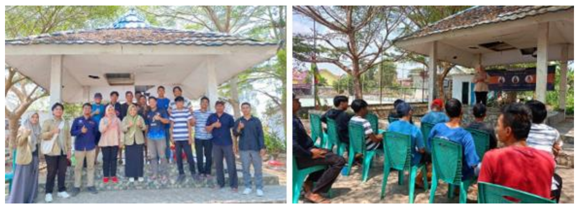
Figure 2. Tour guide training for tourism community in Kurau

This activity was carried out using a module prepared by the service team entitled "A Book to Guide your Guests". Based on the activities that have been carried out, English training activities for tour guides (Figure 2) have an impact on the English language skills of the participants.