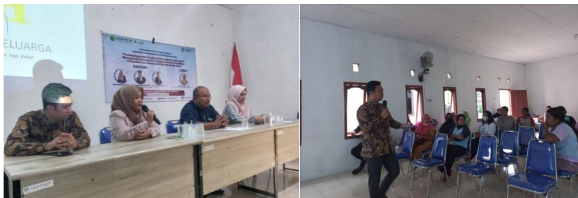
Figure 3. A lecture about the role of education in family life

Lectures were also delivered by three lecturers from Muhammadiyah University of Bangka Belitung, focusing on the role of education in family life and quality family resilience. Key topics included prioritizing children's education, the importance of character education, and the fundamental role of education in building a quality family (Figure 3).