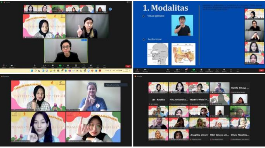
Figure 1. Documentation of AJAR UP 2021

and discussions, especially during sign language learning activities in the second session. However, there were several obstacles experienced before the day of the activity where the registrants for this AJAR UP activity were 48 people. Still, at the time of the announcement, only about 30 people entered the WhatsApp group created. The group link was announced via the email platform so that many participants do not open the email provided and do not join the group link provided in the email. These obstacles made the number of participants who attended the AJAR UP activities only about 28 participants. Meanwhile, on the day of the activity, the obstacle experienced was the lack of stability of the committee signal at the beginning of the activity, namely during the open gate session. The share screen had stopped for a while, the MC and the committee could resolve this by providing information about initial attendance through the Zoom chat column.