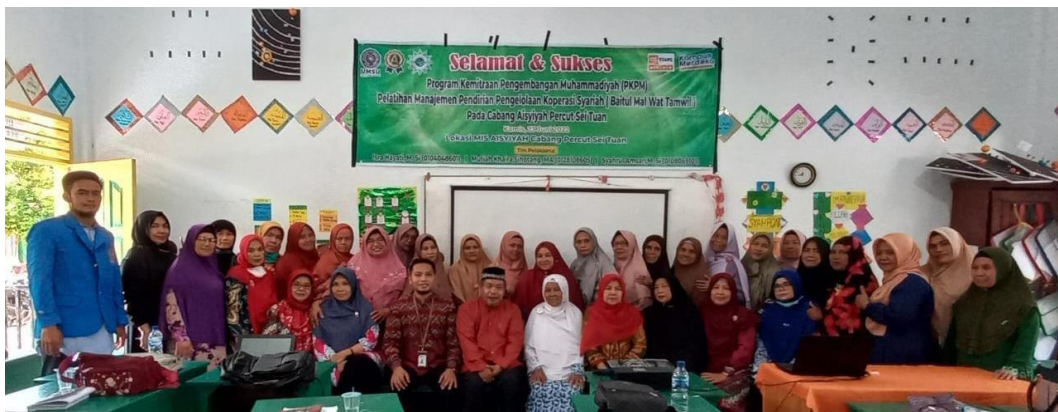
Picture 2. Photos of trainees with trainers

The results of the Muhammadiyah Development Partnership Program (PKPM) activities carried out by the Implementation Team at the Aisiyyah Percut Sei Tuan Branch based on the results of member deliberations resulted in the establishment of a sharia cooperative named Koperasi Syariah Tajri Aj Ma'a and the formation of sharia cooperative administrators and members of sharia cooperatives. This activity was attended by around 45 participants. At the end of the session, the service team and the training participants held a photo documentation together as shown in Picture 2 .