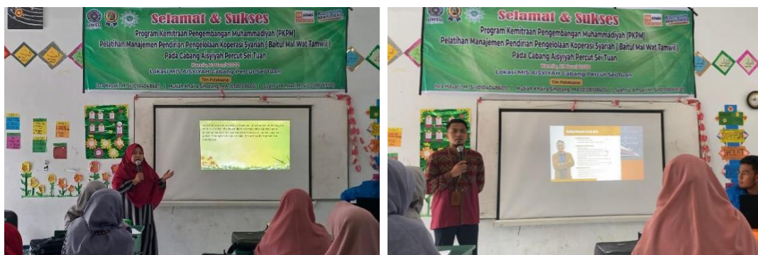
Picture 1. Presentation of material