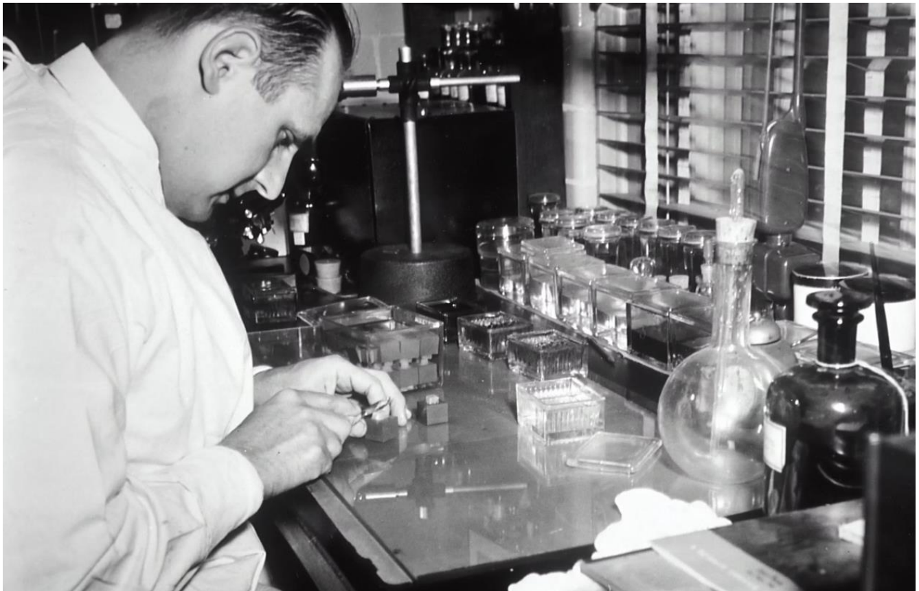
Figure 3. Illustration of clinical trials.

al.,2021). Without robust clinical trials to establish standardized dosing and treatment protocols, promoting honey as a primary intervention risks undermining evidence-based care ( Figure 3 ).