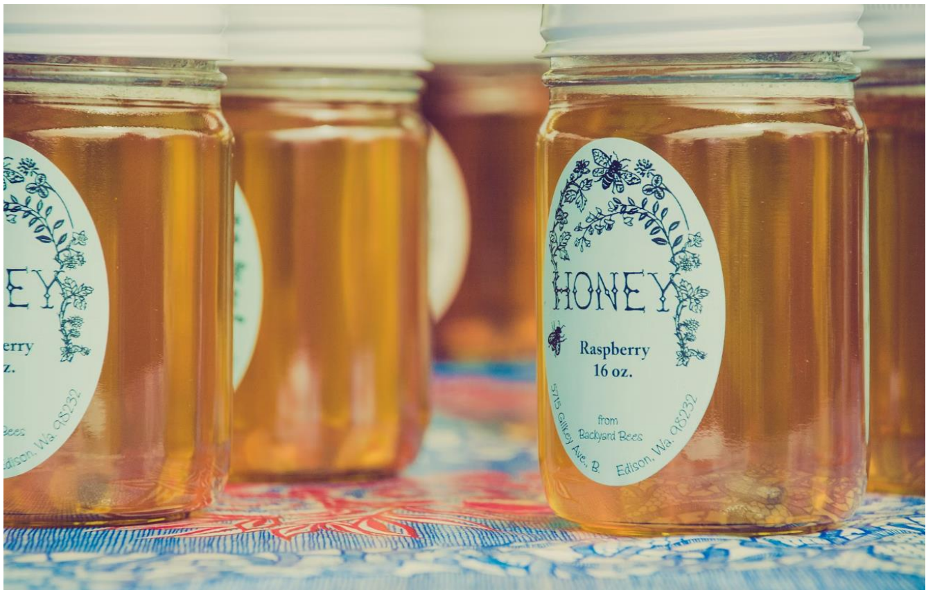
Figure 1. Illustration of honey.

and nutritional balance. Nursing management for children with diarrhea emphasizes restoring fluid and electrolyte balance while educating families. Oral rehydration solutions (ORS) such as Pedialyte or honey can be used for fluid replacement, alongside breastfeeding if appropriate (Mahyar et al., 2022). Honey plays a crucial role in managing diarrhea in children, serving as both a natural and effective complementary treatment ( Figure 1 ). Its importance stems from its antimicrobial and anti-inflammatory properties, which help combat pathogens responsible for diarrhea, such as bacteria, viruses, and parasites (Masad et al., 2021). Research indicates that honey can inhibit the growth of common diarrheal pathogens, including Escherichia coli , Salmonella , and Shigella , as well as rotavirus, the leading viral cause of diarrhea in children (Mandal & Mandal, 2011). Honey's natural sugars, particularly fructose and glucose, provide an energy source that aids in recovery, especially in malnourished children (Samarghandian, Farkhondeh, & Samini, 2017). Furthermore, honey facilitates faster rehydration by improving the absorption of fluids and electrolytes in the intestine, making it a valuable addition to oral rehydration therapy (ORT) (Abdulrhan, Mekawy, Awadalla, & Mohamed, 2010). In nursing practice, the inclusion of honey in treatment protocols can enhance the effectiveness of ORT while promoting a holistic approach to care.