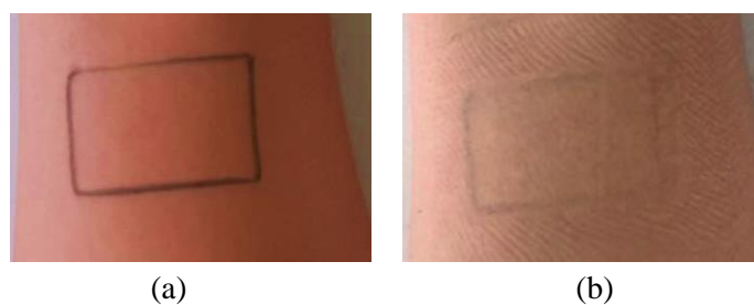
Figure 2. Appearance of irritation test results on the forearm: (a) before; and (b) after application of 5% bawang dayak extract cream for 24 hours