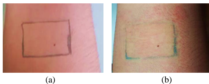
Figure 3. Appearance of irritation test results on the forearm: (a) before; and (b) after application of 20% bawang dayak extract cream for 24 hours