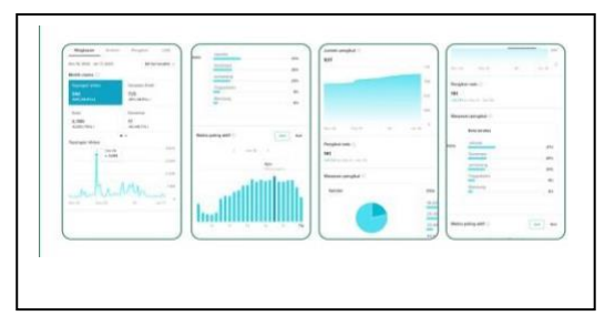
Figure 2. Graphic of TikTok Viewers and Followers

A significant increase can be seen from the number of followers and viewers on the TikTok, Instagram, and YouTube platforms of Komplek Q. Meanwhile, for the website, Twitter, and Facebook, the increase is not as rapid as the three other platforms. The graphs in Figures 2, 3, and 4 provide concrete evidence of the increase in viewers to the three social media of Komplek Q in February 2023.