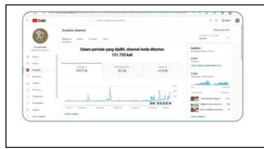
Figure 4. Graphic of Youtube Viewers and Followers

The three graphs show Komplek Q's efforts to stay up-to-date with the development of the digital world. The increase in viewers and followers is as the result of contents that are always updated and interesting, covering topics around Islamic boarding schools such as Islam, education, and the aspirations of students (opinions, poetry, and short stories). According to the results of interviews with the coordinator of the media and publication division, the content uploaded always on the latest activities at the Islamic boarding school, because the moment has a particular period or time.