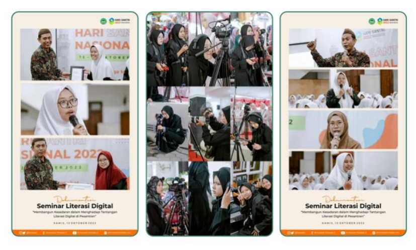
Figure 5. Digital Literacy Activity

for prospective new students and the community who want to memorize the Al Quran while pursuing formal education. Komplek Q, as one of the branches of Islamic boarding schools under the auspices of Pondok Pesantren Al Munawwir, has the largest number of female students compared to other complexes. The programs offered by Komplek Q not only include Tahfidz Al Quran but also Madrasah Diniyah and various extracurricular activities that develop and train the students' potential. Therefore, prospective students can choose the appropriate program and develop their abilities at Pondok Pesantren Al Munawwir Krapyak Yogyakarta.