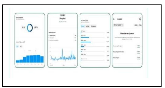
Figure 3. Graphic of Instagram Visitors and Followers